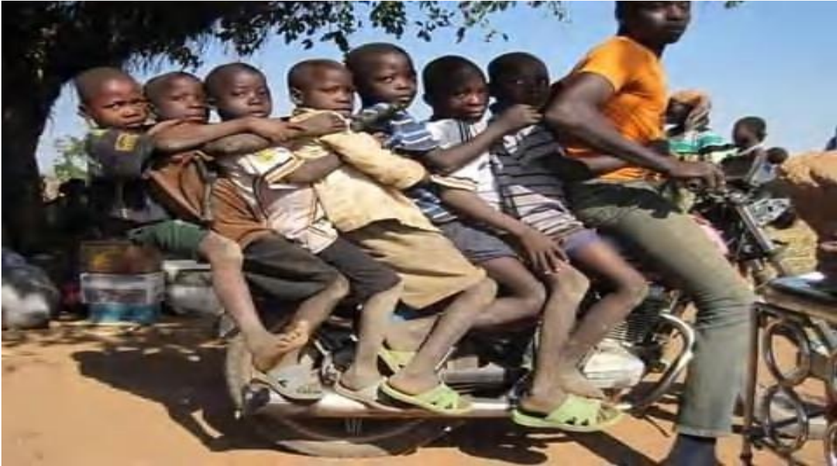
Bringing Children back to their Parents