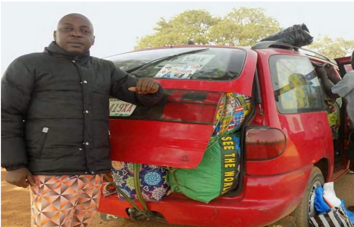
Mission President ready to go